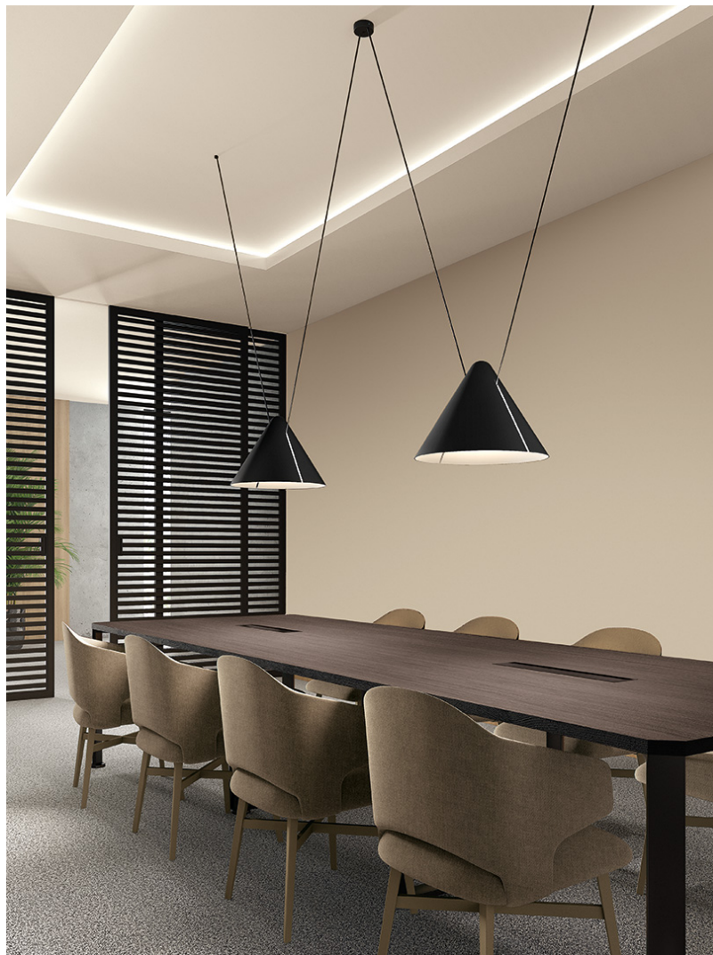
Image may not match reference. LedsC4 reserves the right to amend any of the product's components. The data related to flux, power and colour temperature may be subject to changes made by the manufacturer.